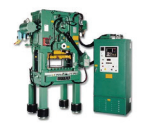
TYPICAL PUNCH PRESS

The inhalation of beryllium-containing dust, mist or fume can cause a serious lung condition in some individuals. The degree of hazard varies depending on the form of the product and how the material is processed and handled. You must read the product specific Safety Data Sheet (SDS) for additional environmental, health and safety information before working with any beryllium-containing alloys.